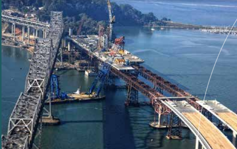
BAY BRIDGE, USA