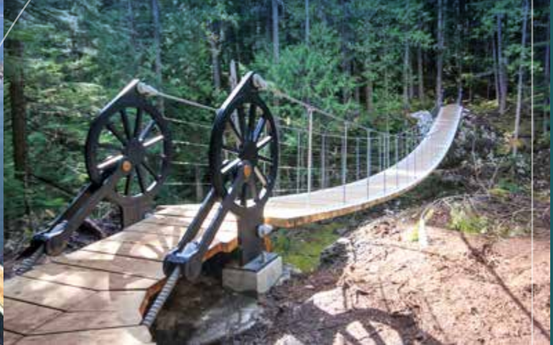
TRAIN WRECK BRIDGE, BC