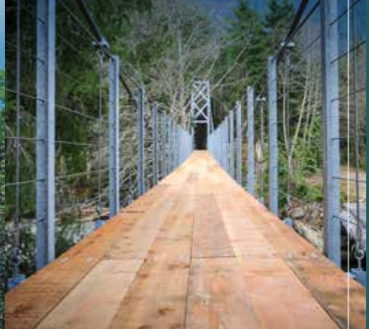
SEA TO SKY BRIDGE, BC