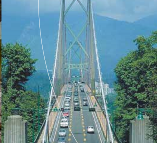
LIONS GATE BRIDGE, BC