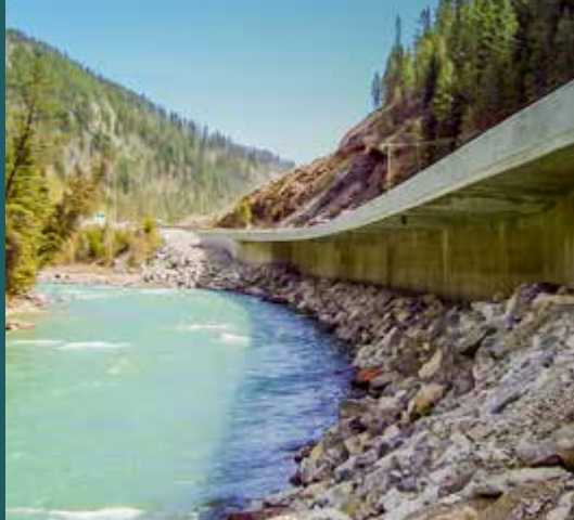
KICKING HORSE CANYON, BC