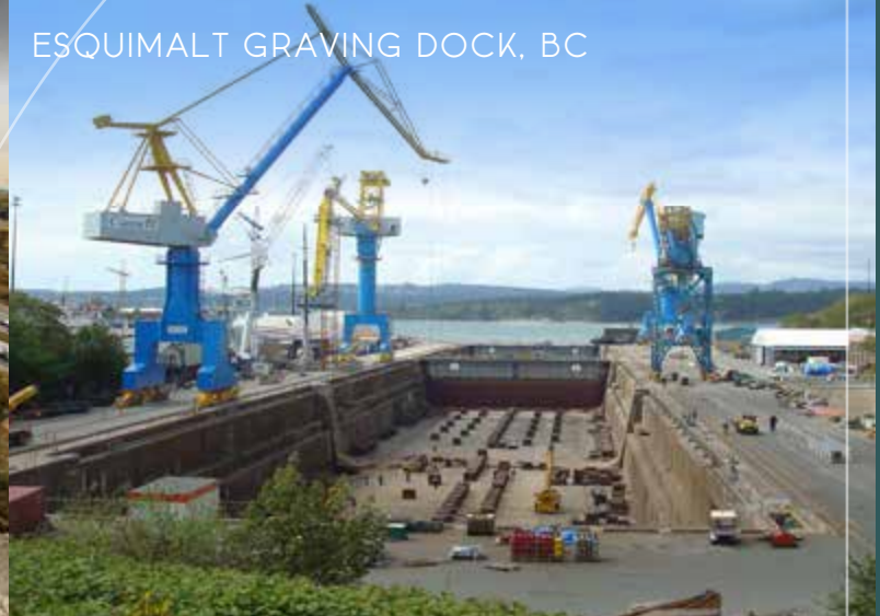
ESQUIMALT GRAVING DOCK, BC