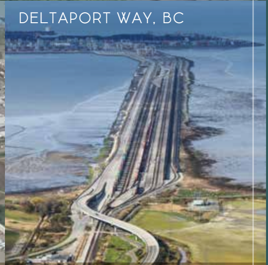
DELTAPORT WAY, BC