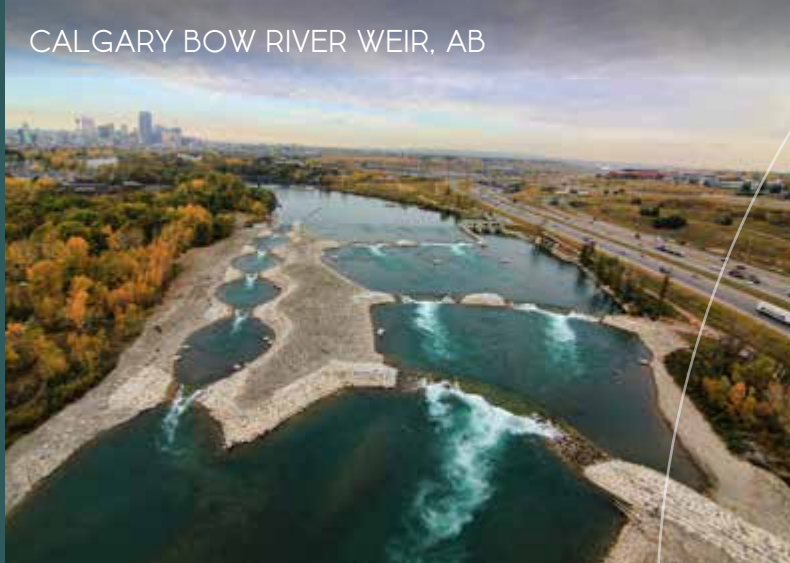
CALGARY BOW RIVER WEIR, AB